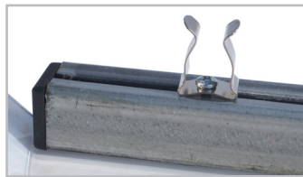
Adjustable back bar mounting clips