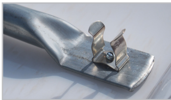
Fixed support finger clips