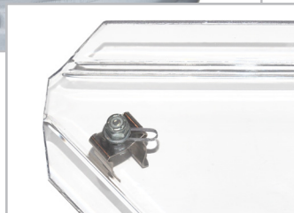
Frameless mounting clips